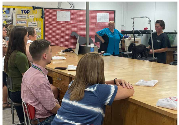
A student from the Canine Clippers Grooming School discusses tips and tricks for grooming various dog breeds and how teachers can educate their students about the proper way to take care of companion animals.