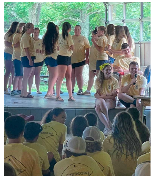
Campers performing at the camp talent show.