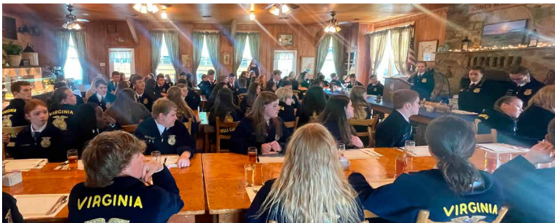
Campers at the banquet Thursday evening.