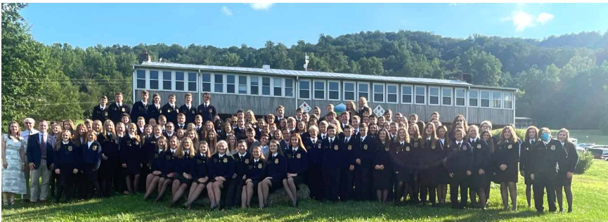
The annual picture of the overnight campers in front of the main lodge before the banquet Thursday evening.

challenged to put what they learned in their teamwork and communication leadership workshops to use to have a successful game. During the variety show campers and their groups showed off their talents and skills, such as singing, dancing, comedy, and playing the ukulele. The Past State Officer team and new 2022-2023 State Officer Team also had acts in the variety show. On Wednesday night of camp, the overnight campers received the opportunity to visit the Madison County Fair for a night out of fun and to represent Virginia FFA. The overnight campers also had the opportunity to compete in a few contests as well as running for camp offices. Contests that members competed in included: Creed, Prepared Public Speaking, and Extemporaneous