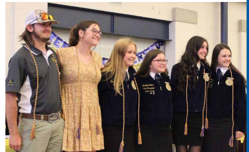
Dinwiddie FFA's graduating seniors after receiving their FFA graduation cords!