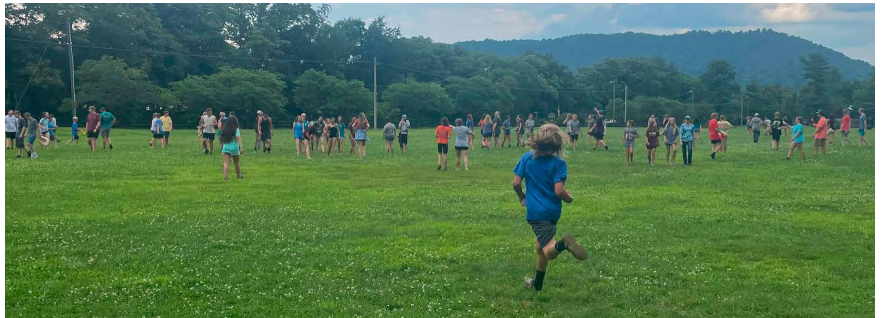
The campers enjoying a friendly game of capture the flag with the new State Officer team.

Virginia FFA Leadership Camp is where FFA members of any age come to learn how to be stronger leaders and make numerous new connections with people from all across the commonwealth. Campers that came for day camp got to participate in leadership classes, speciality classes, group games, a variety show, and reflections.