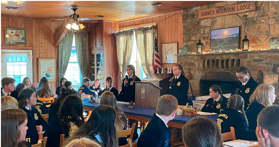
The 2022 Virginia FFA Camp Officers performing opening ceremonies at the banquet Thursday evening.