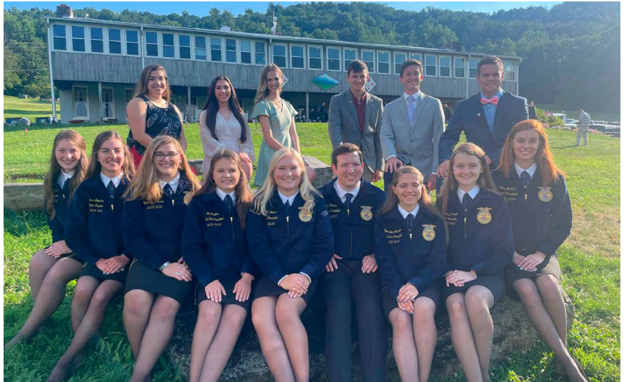
The 2022-2023 State Officer team with the 2021-2022 State Officer team.

Public Speaking. The winners of the contests were announced at the Camp Banquet on Thursday. Other camp-wide awards were given out at the banquet to campers who showed an immense amount of growth, good character, and the drive to better themselves and the others around them. At the banquet the recently elected Camp Officer Team did opening ceremonies and helped to run the show. On the Friday morning of Camp, there was a final awards ceremony where everyone in each group was recognized for individual growth in each of the campers leadership abilities increased substantially and they all deserved praise for that.