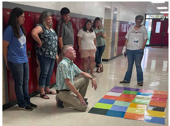
Using colorful squares, teachers explore ideas for educating students about ideal layouts of school garden beds during a workshop hosted by Virginia Ag in the Classroom.